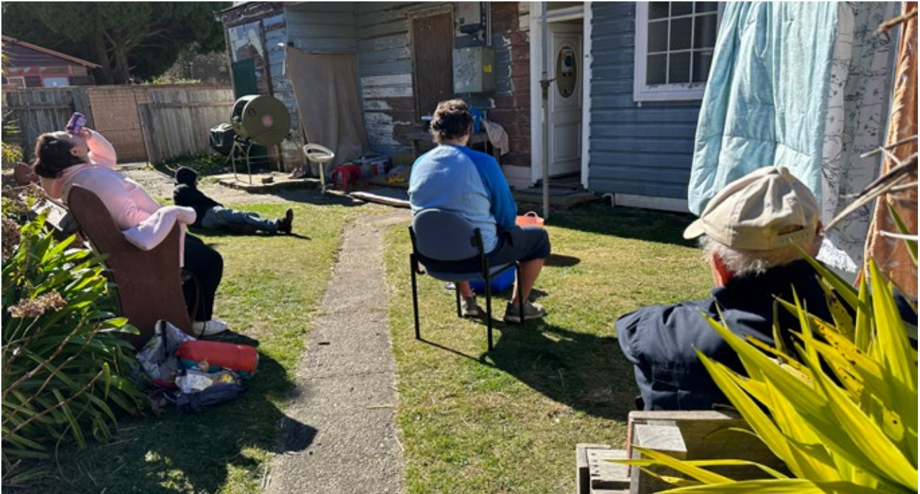
Waiting for the Shower 27 July 2023.

The facility also acts as a hub, which, in conjunction with Junction 142's other activities, provides a safe space for people to access information on housing and health issues.